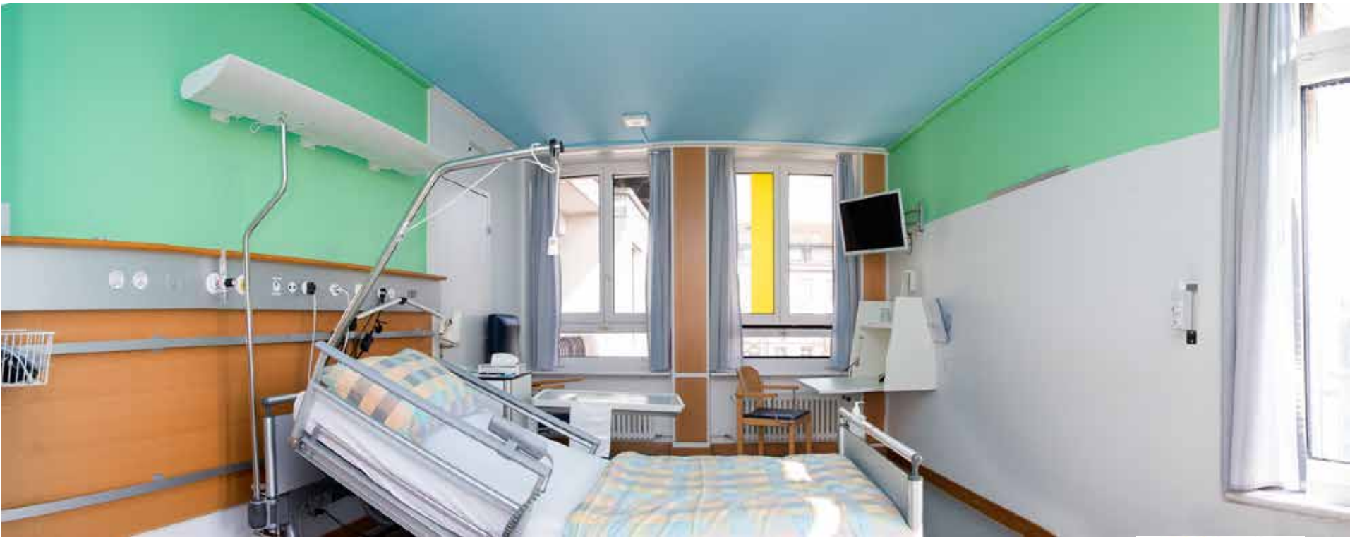
Honegger Room in the HPB Center